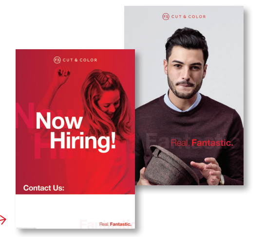
Adhere stickers or use Sharpie