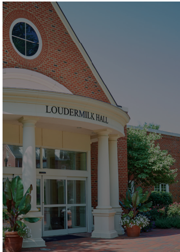
Loudermilk Hall features three tiered amphitheaters, 21 breakout rooms and a dedicated, flat-floored multi-purpose space that allows for easy partitioning.